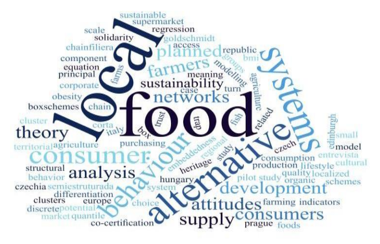
Figure 2: What comes to the minds of consumers when they think about buying in the street market.

Source: Survey data generated by Iramuteq (2021)