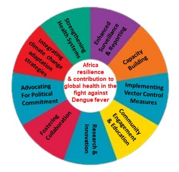
Figure 2: Africa Resilience and contribution to global health in the fight against Dengue fever: key aspects.